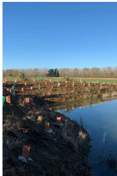
Harpley Farm Sediment Trap planting