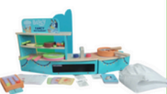
Blueys Tabletop Restaurant