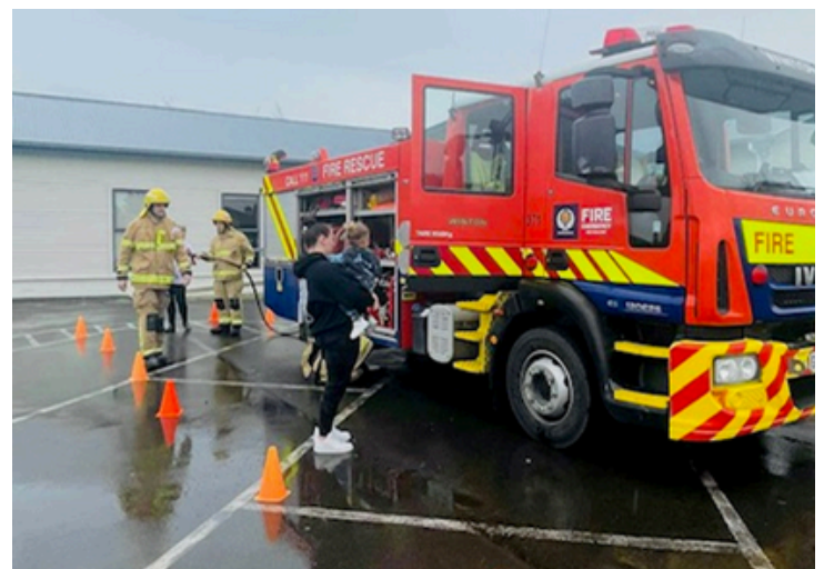
The Winton Fire Brigade at a recent visit to the Little Stars Music playgroup.

This term we have been focusing on health and wellbeing and have been privileged to have visits from both the Winton Police and the Winton Fire Brigade. The Police provided education and guidance on helmet safety – why we use them and how to use them effectively. The Winton Fire Brigade came with a great message and taught the children about the importance of getting out and staying out. Children were able to have a look at the fire engine and were very excited by the siren! These visits have provided valuable learning opportunities as well as moments of great enjoyment for the children and we love that we can partner with outside agencies and work together to build a stronger, more resilient community.