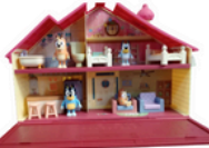
Blueys family home