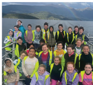
Room 4: Year 5 & 6 - Te Anau

The PTA recently hosted a very successful 'Golf Ball Drop' fundraiser. This was well supported by the community and local businesses. All proceeds will go towards upgrading much needed classroom furniture and technology devices. We are very blessed to have such a proactive committee that makes things happen for our children.