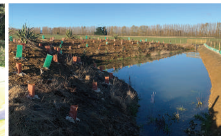
Harpley Farms Sediment Trap