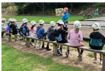
Room 3: Year 3 & 4 - Camp Columba