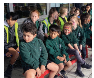
Children watching on as the Digger Drop takes place.