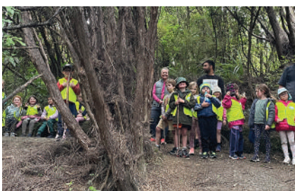
Room 1 & 2: Year 0-2 - Camp Omaui