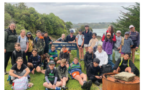
Room 5: Year 7 & 8 - Stewart Island