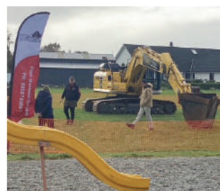
Golf Ball Digger Drop Fundraiser