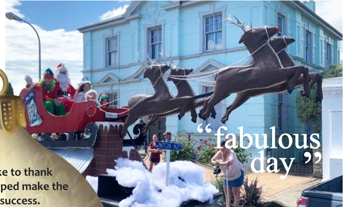
Congratulations to Lochiel School for winning the “Best Float” in the Santa Parade and receiving the trophy donated by Country Jewel.