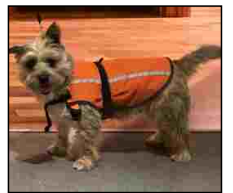
Poppy Woodd ready for her morning walk