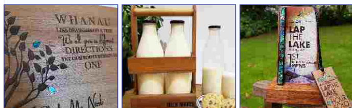
- Customised or plain Milk crates, 2 or 4 bottles -

created from mostly recycled and natural materials.... proudly made in Winton