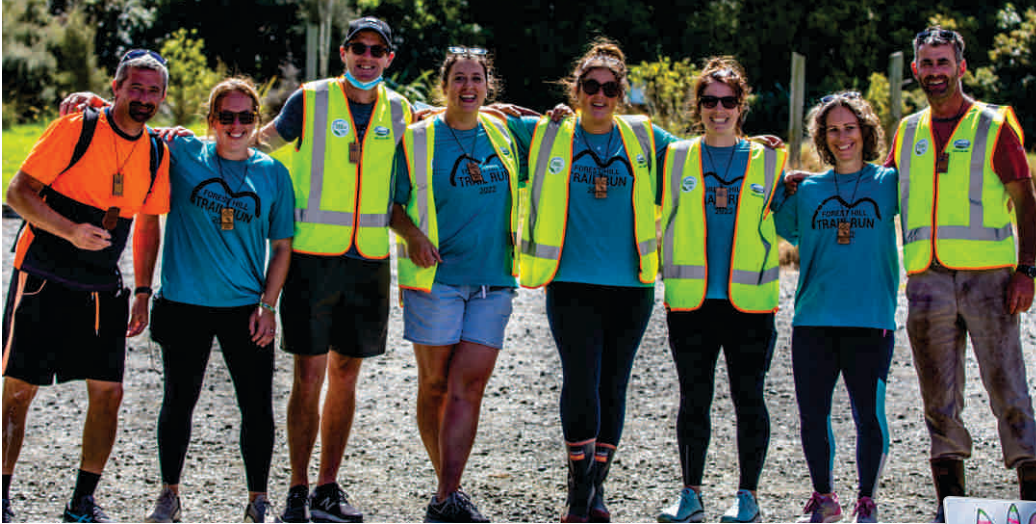
The Forest Hill Trail Run crew